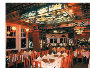
Double Dragon (Hastings)

Please visit our website for our Full Restaurant Menu and Wine List