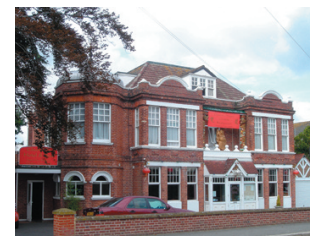
Churchills Hotel (Hastings)